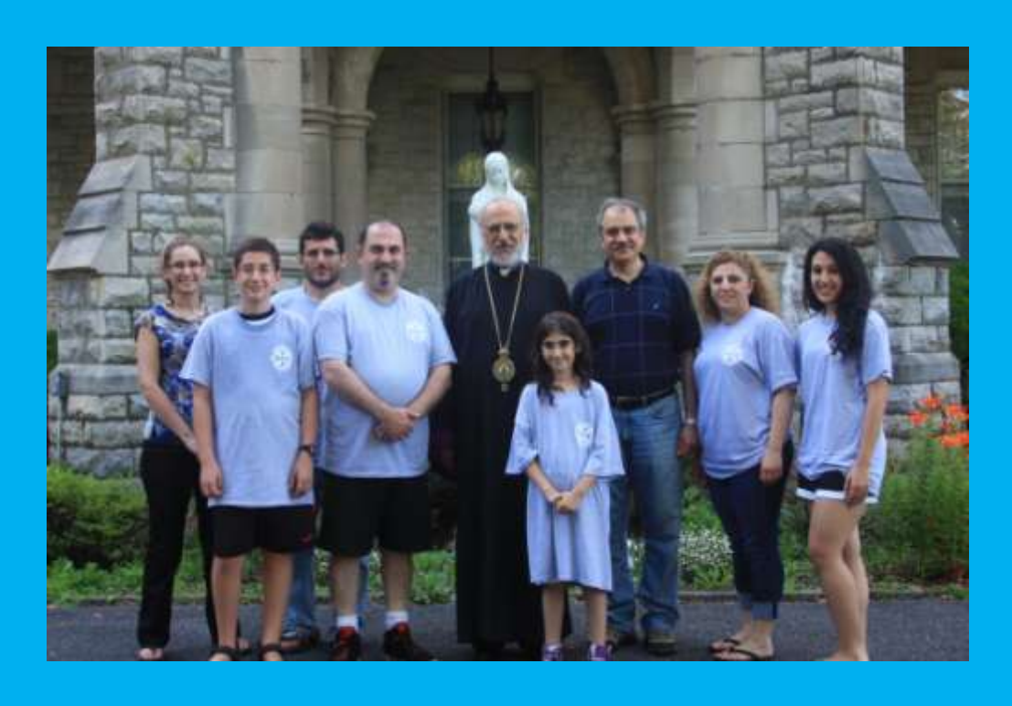
Archbishop Oshagan with parishioners of the St. Illuminator's Cathedral