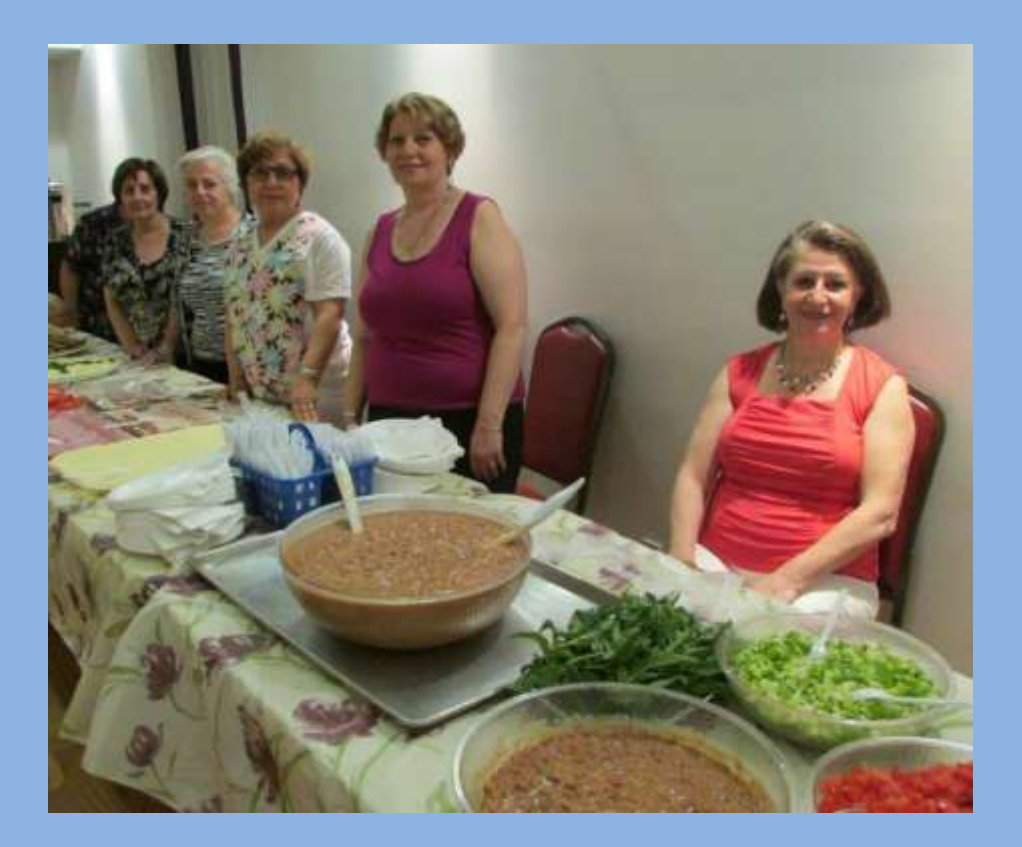
Ladies Guild getting ready to serve