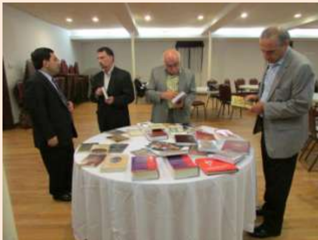
Display of the Armenian literature books