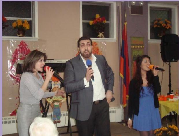
The Cathedral's "Huyser" Ensemble entertained the residents