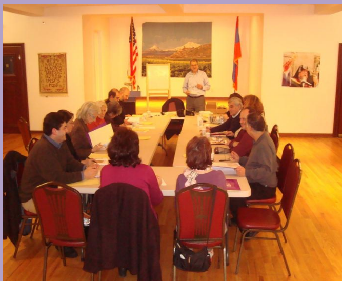
The first of a four-part program on the Eucharist ( Soorp Badarak )

For information and registration, please visit www.armenianprelacy.org or call (212) 689-7810 (Prelacy) or (212) 689-5880 (Cathedral).