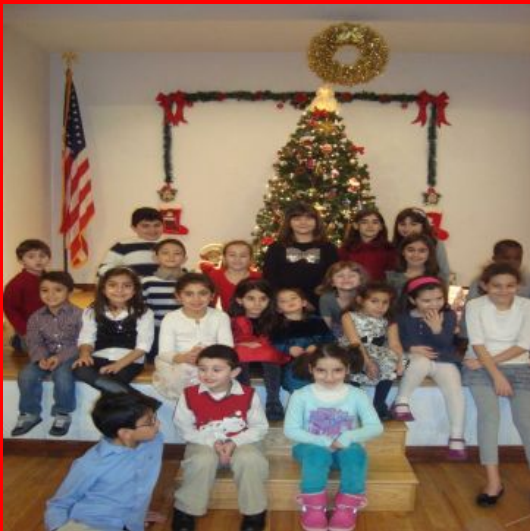
Children are waiting for Santa's arrival