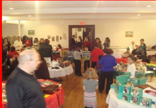
Community enjoys shopping and supporting their church