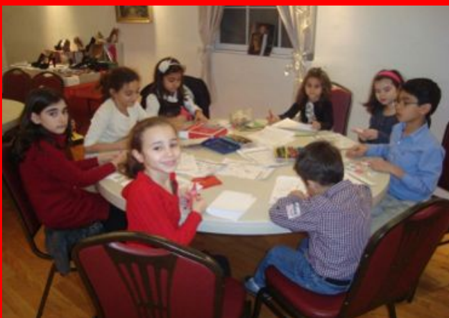
Students are making Christmas crafts