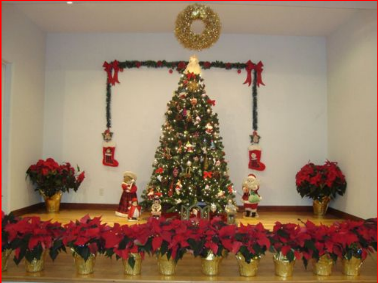
St. Illuminator Cathedral's Christmas Tree

221 East 27 th Street, New York, NY 10016 Tel: 212-689-5880 Fax: 212-889-1174 E-Mail: office@stilluminators.org Website: www.stilluminators.org