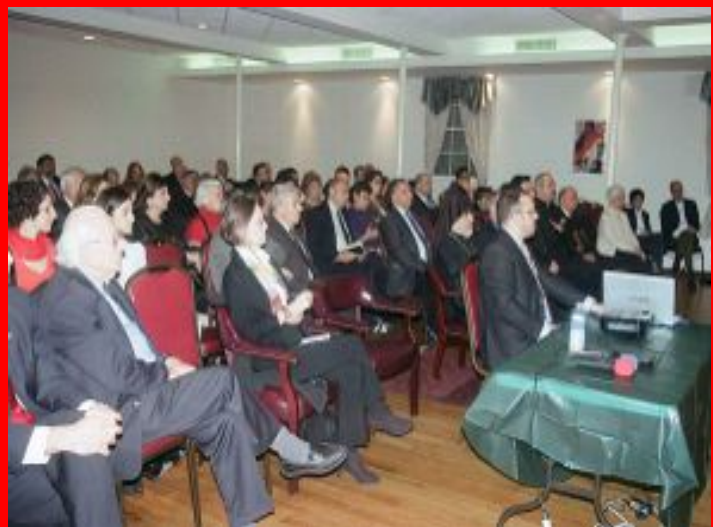
Community members filled Pashalian Hall to hear the Ambassador’s message