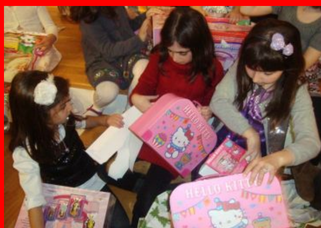
Children are opening their gifts