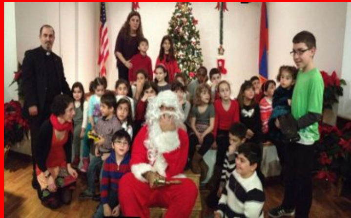
Santa gave each child a special gift