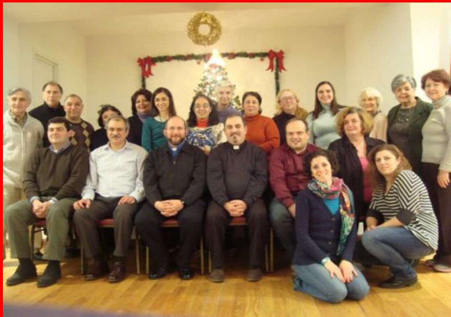
The participants of the four-part program on the Eucharist