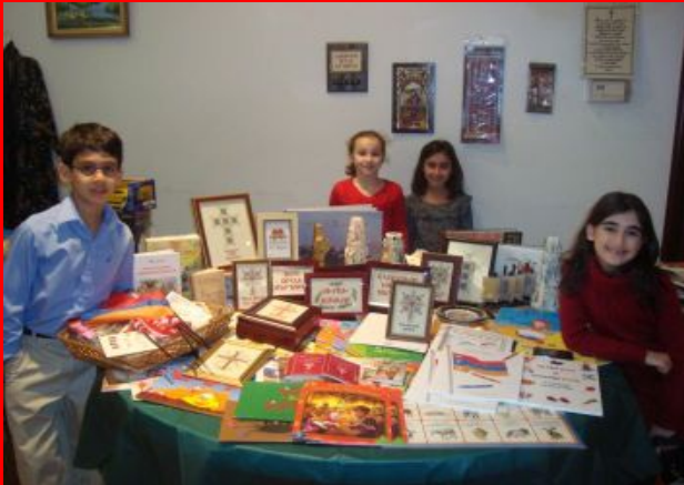
Sunday school students help the Ladies Guild