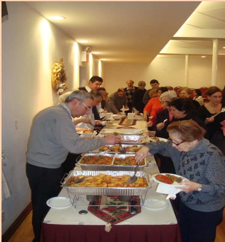
Parishioners are enjoying delicious food