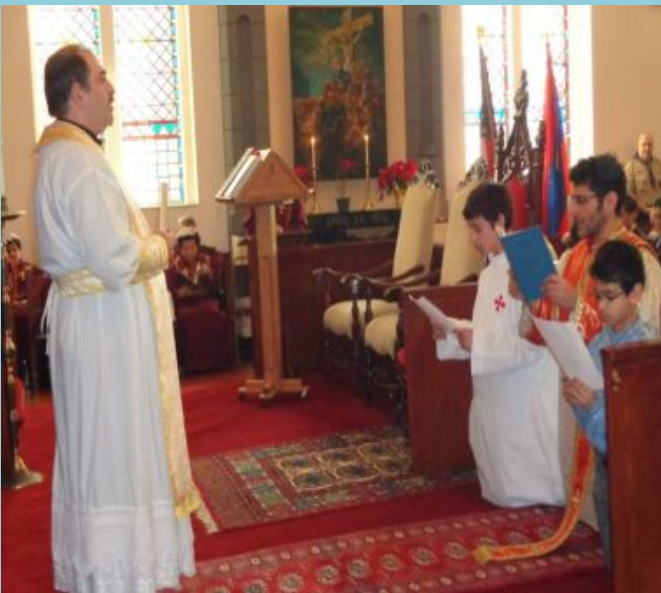
Sunday school students reading the Confession In Armenian