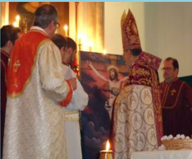
Archbishop Cholyan consecrates the painting of Crucifixion