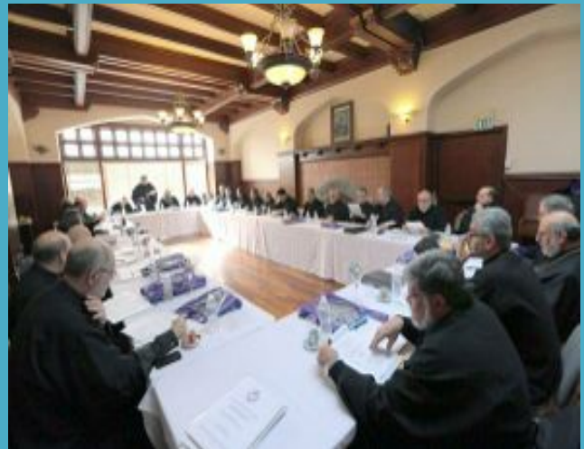
The clergy during the Ghevontiantz conference