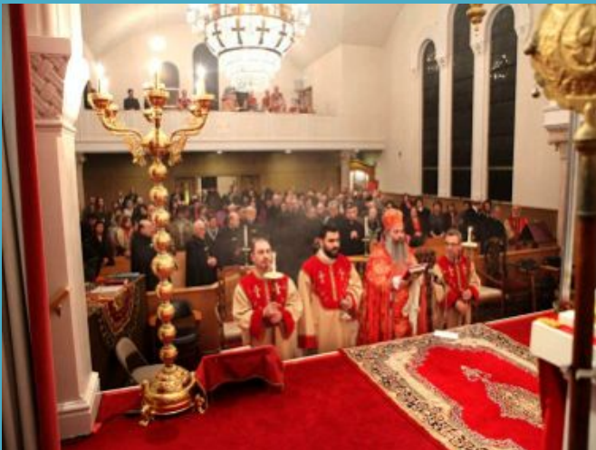
Divine Liturgy at the St. Gregory Armenian Church

Clergy visited Krouzian-Zakarian-Vasbouragan Armenian School where the students presented Vartanantz program. They also visited the Cross on the Mount Davidson. The Cross has been purchased by the council of Armenian American organizations of Northern California and the bronze plaque has been installed at the base memorializing the victims of the 1915 Armenian Genocide. Conference concluded by the Divine Liturgy.