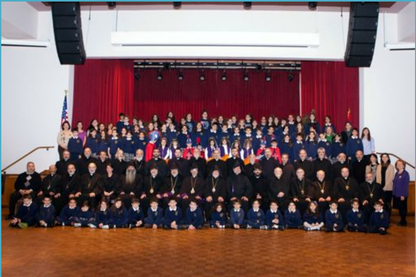
CLERGY WITH THE STUDENTS OF KROUZIAN-ZAKARIAN-VASBOURAGAN ARMENIAN SCHOOL

221 East 27 th Street, New York, NY 10016 Tel: 212-689-5880 Fax: 212-889-1174 E-Mail: office@stilluminators.org Website: www.stilluminators.org