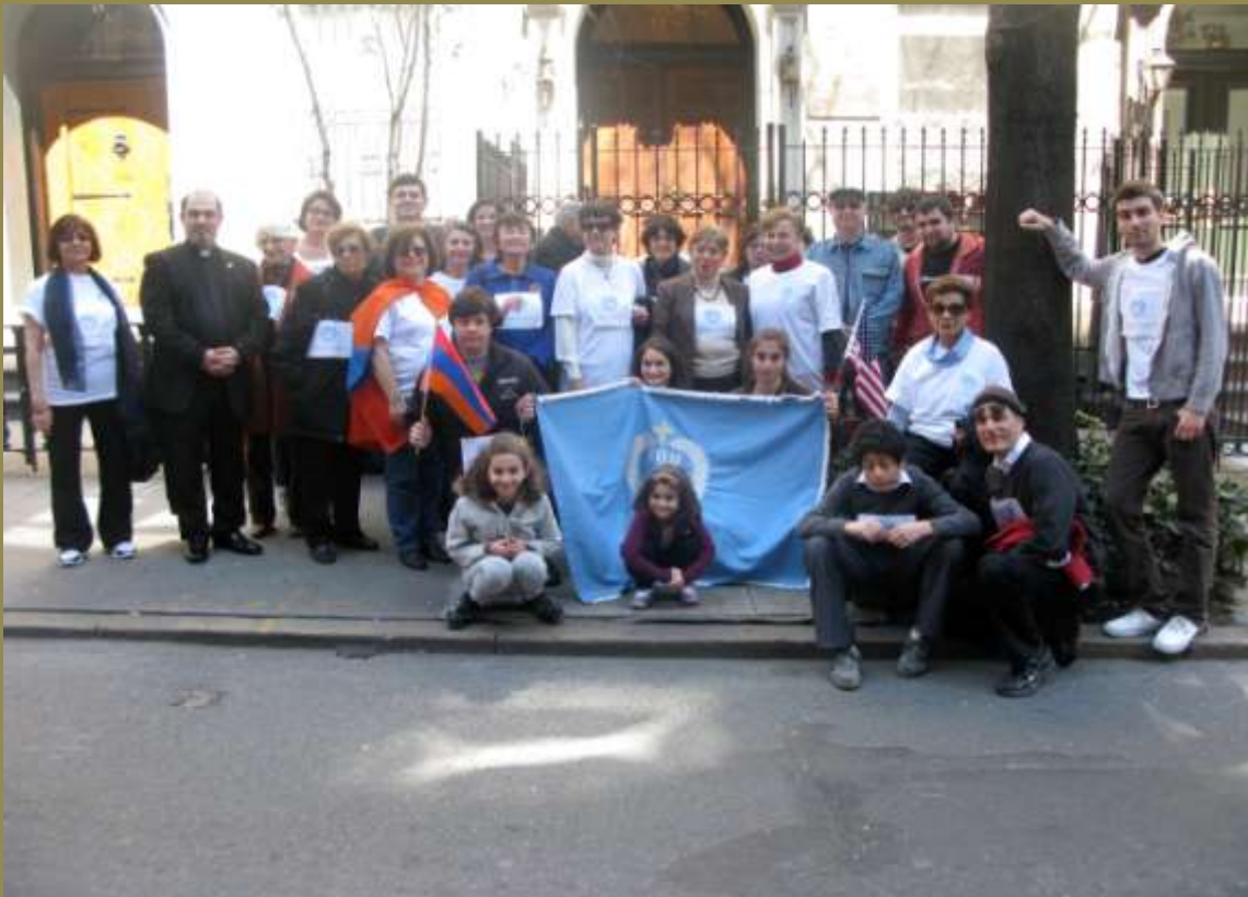
Participants of the ARS "Walk Armenia" in front of the Armenian Mission to the United Nations on 36th Street