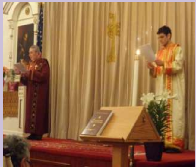
Easter Eve (Jrakalooys)