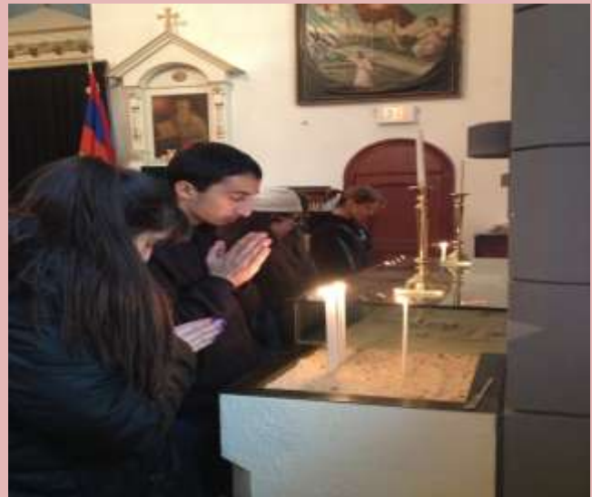
Students are praying