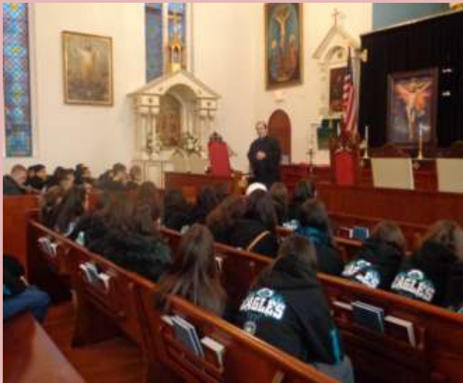
Der Mesrob during the presentation