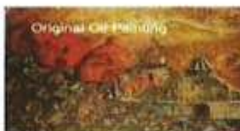
Original Oil Painting

Armenian Relief Society is a 501 (c)(3) non profit organization