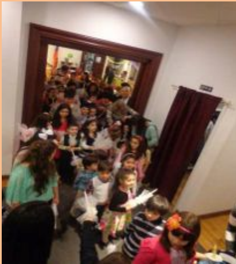
Palm Sunday (Ծաղկազարդ) at the Cathedral

221 East 27 th Street, New York, NY 10016 Tel: 212-689-5880 Fax: 212-889-1174 E-Mail: office@stilluminators.org Website: www.stilluminators.org