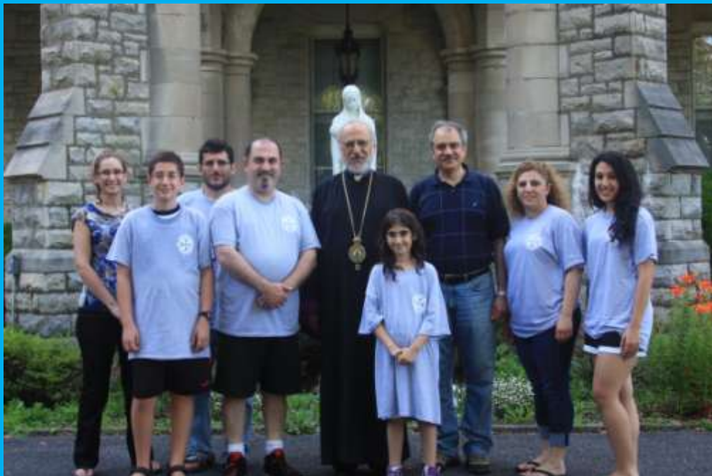
Archbishop Oshagan with parishioners of the St. Illuminator's Cathedral