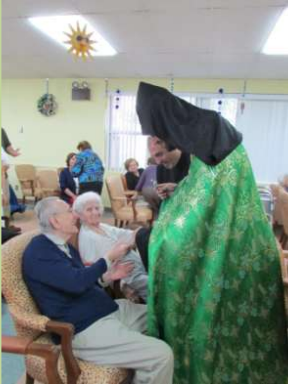
Hayr Sourp blessing residents