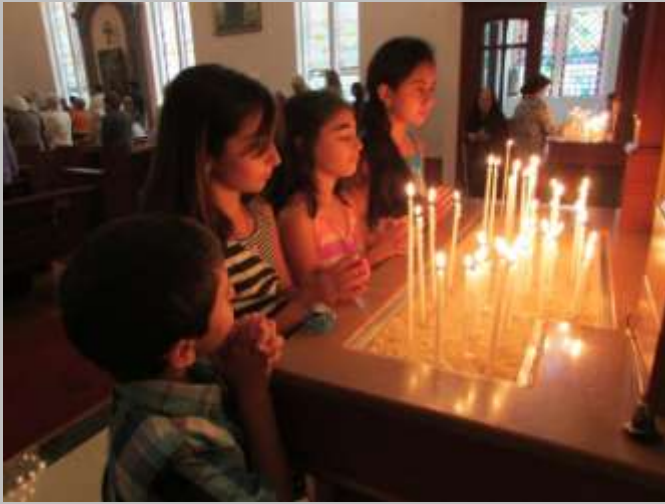
Sunday school students praying