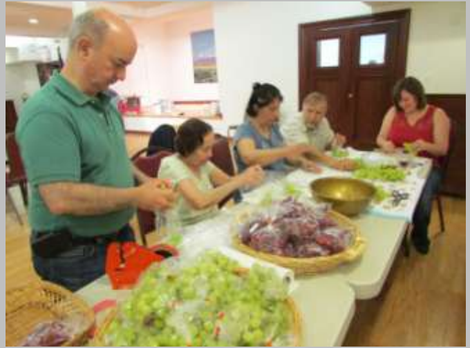
Parishioners are preparing grapes to be blessed